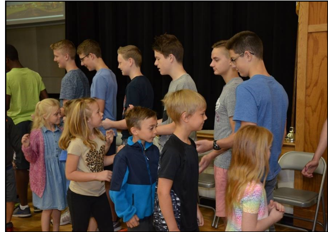
The 8th graders said goodbye to the rest of the school after their last Chapel.

Crown Point Christian School has an immediate need for a part-time Development Director . CPCS also has the following positions open for the 2017-2018 school year: Full-time fifth grade teacher , full-time vocal/general music teacher , part-time elementary school technology teacher , and part-time one-on-one Student Services aides . Please go to www.crownpoinchristian.org/Welcome/Career Opportunities for more information.